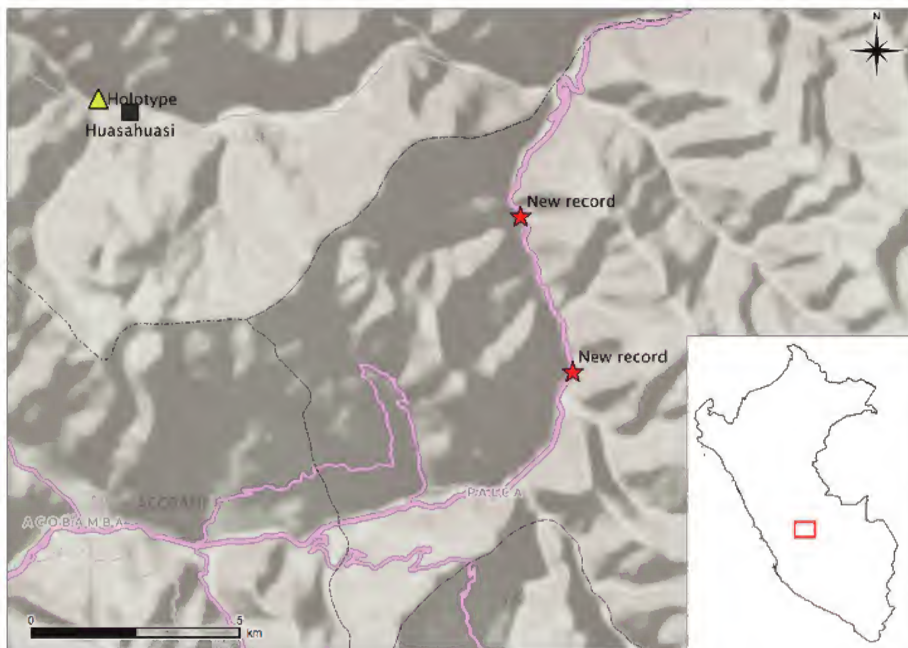
Fig. 1. Map showing the currently known distribution of Pristimantis pardalinus . The yellow triangle indicates the location of the type locality and the red stars indicate the location of new records reported in this study. The inset shows the location of the study area in Peru (red box).

type locality of P. pardalinus (Fig. 1). We focused our search on hillsides located next to the Carretera Central road, Palca District, Tarma Province (Fig. 2). The habitat at the selected sites was a mix of scrubland dominated by terrestrial bromeliads and Peruvian feather grass; two sites also had small patches of cloud forest vegetation. Altogether, we inspected approximately 150 terrestrial bromeliads between 9:00 h and 16:00 h, and found seven individuals of P. pardalinus at two sites. All individuals were found inside bromeliads of the genus Tillandsia . These bromeliads are commonly distributed along various sections of the road connecting Palca and San Ramón, as well as the road connecting the Carretera Central and Huasahuasi (Fig. 2). One individual (MUSM 33278) was collected from the first site ( 11^{\circ}19'15.78''\text{S} , 75^{\circ}33'07.81''\text{W} ) at 2,702 m elevation and six individuals (MUSM 33279-33281; MVZ 272273-272275) were collected from the second site ( 11^{\circ}17'17.77''\text{S} , 75^{\circ}33'47.77''\text{W} ) at 2,591 m elevation. Morphometric data for all specimens are shown in Table 1. We surveyed three additional sites along the Carretera Central (section connecting Palca and San Ramón) and one site along the road connecting the Carretera Central and Huasahuasi (the type locality), but did not find additional individuals of P. pardalinus (Fig. 1).